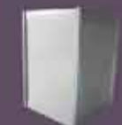
INNO20 Display Plinth B - L535 x D535 x H750 -