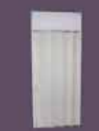
INNO31* Folding Door - L950 x H2150 -