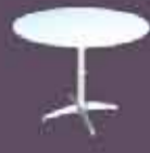
INNO04 Round Table - Dia900 x H755 -