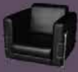
INNO17 Leather Chrome Sofa - L860 x D800 x H800 -