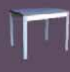
INNO06 System Coffee Table - L550 x D550 x H515 -