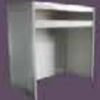
INNO02 Information Counter - L1030 x D535 x H1020 -