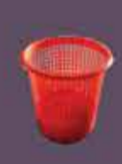
INNO28 Waste Paper Basket