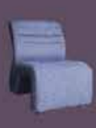
INNO16 Fabric Sofa - L520 x D750 x H780 -