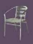
INNO15 Chrome Chair - L420 x D415 x H700 -