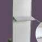
INNO23* Slope Shelf - L985 x D300 -