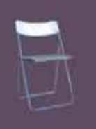
INNO12 Folding Chair - L435 x D435 x H790 -