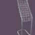
INNO24 Brochure Rack 4-tier - L280 x D400 x H1100 -