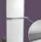
INNO22* Flat Shelf - L985 x D300 -