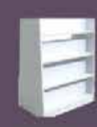
INNO26 Book Shelf 4-tier Double-sided - L970 x D600 x H1400 -