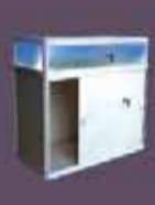
INNO10 Low Showcase - L970 x D500 x H940 -