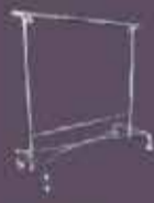
INNO29 Coat Rack - L950 x D400 x H1500 -