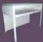
INNO01 Information Desk - L1000 x D530 x H735 -