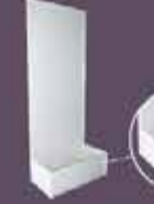
INNO32* System Plant Trough - L1030 x D535 x H350 -