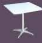
INNO05 Square Table - L750 x D750 x H755 -