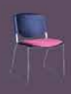
INNO13 Conference Chair - L460 x D500 x H780 -