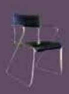
INNO14 Easy Arm Chair - L500 x D450 x H800 -