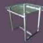
INNO07 Glass Top Coffee Table - L460 x D490 x H490 -