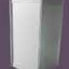
INNO21 Display Plinth C - L535 x D535 x H1000 -