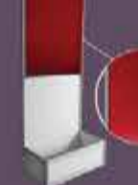
INNO30* Display Board (Red / Black) - L950 x H1200 -