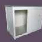
INNO08 Lockable Cabinet - L1000 x D530 x H735 -