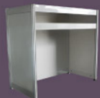
INN002 Information Counter - L1030 x D535 x H1020 -