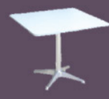
INN005 Square Table - L750 x D750 x H755 -