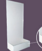
INN032* System Plant Trough - L1030 x D535 x H350 -