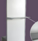
INN022* Flat Shelf - L985 x D300 -