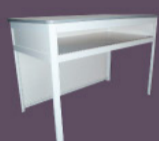
INN001 Information Desk - L1000 x D530 x H735 -