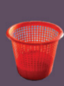
INN028 Waste Paper Basket