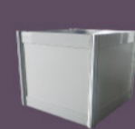
INN019 Display Plinth A - L535 x D535 x H500 -