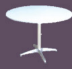
INN004 Round Table - Dia900 x H755 -