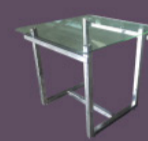
INN007 Glass Top Coffee Table - L460 x D490 x H490 -