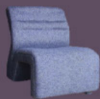
INN016 Fabric Sofa - L520 x D750 x H780 -