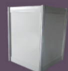
INN020 Display Plinth B - L535 x D535 x H750 -