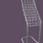
INN024 Brochure Rack 4-tier - L280 x D400 x H1100 -