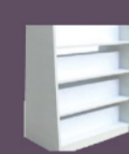
INN026 Book Shelf 4-tier Double-sided - L970 x D600 x H1400 -