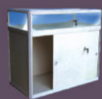
INN010 Low Showcase - L970 x D500 x H940 -