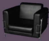
INN017 Leather Chrome Sofa - L860 x D800 x H800 -