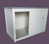
INN008 Lockable Cabinet - L1000 x D530 x H735 -