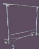
INN029 Coat Rack - L950 x D400 x H1500 -