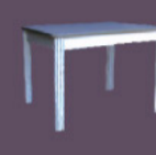
INN006 System Coffee Table - L550 x D550 x H515 -