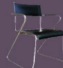
INN014 Easy Arm Chair - L500 x D450 x H800 -