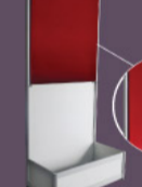
INN030* Display Board (Red / Black) - L950 x H1200 -