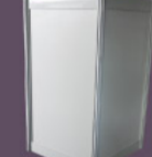
INN021 Display Plinth C - L535 x D535 x H1000 -