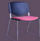
INN013 Conference Chair - L460 x D500 x H780 -